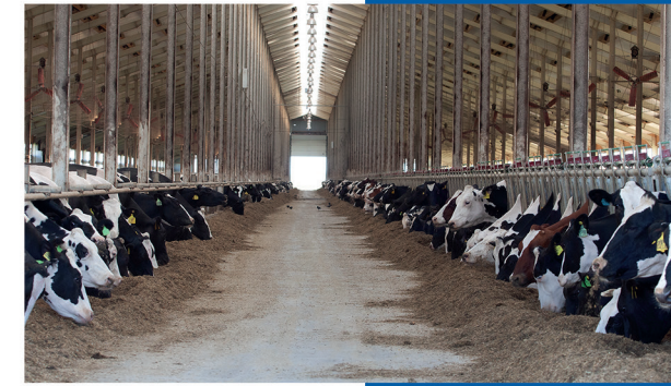
6. Dairy Farm and Heifer Center for 12,000 heads Serdobsk