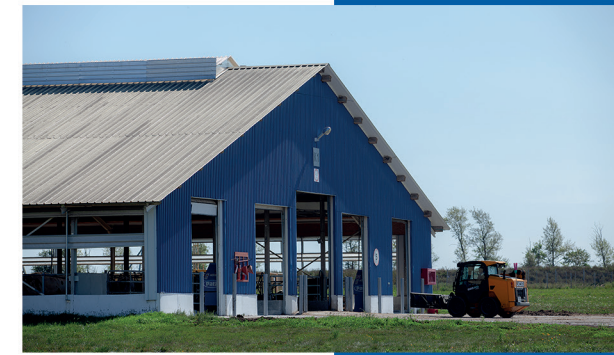
4. Dairy Farm for 4,650 cows Narovchat