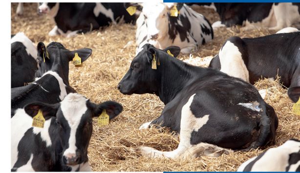
5. Heifer Center for 5,200 heads Kuznetsk